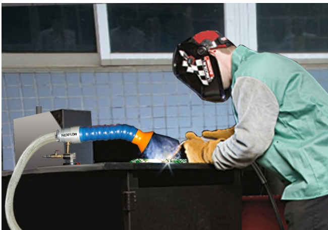
← Stream Vac™ removing soldering fumes from a circuit board soldering station